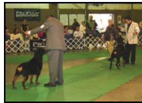
Winners Dog & Winners Bitch