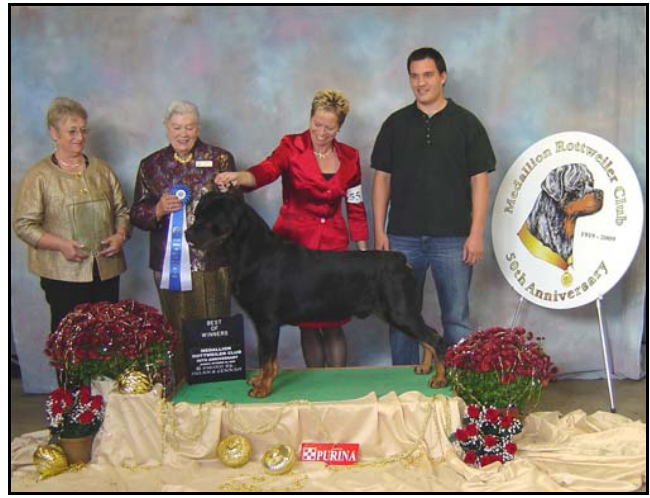
Best of Winners - Winners Dog - Cammcastle's I'm Bettin On It