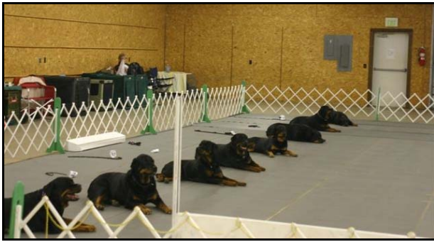
Obedience - Long Down