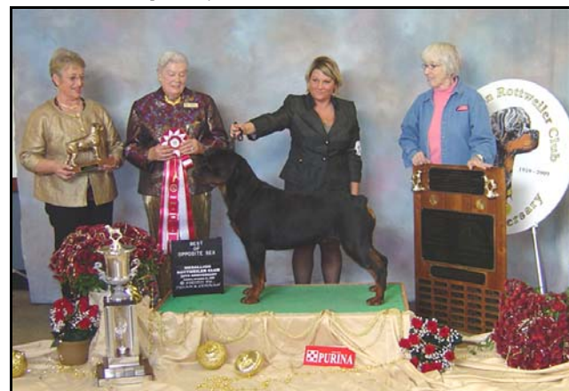
Best of Opposite Sex in Speciality Show - CH Von Hoffman's Antsy Prance