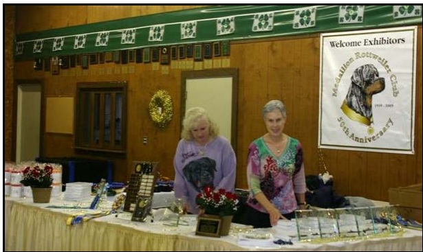
Obedience Awards Table

Fortunately, the show was held indoors as the blustery cold, rainy weekend progressed. Distractions were held to a minimum for the obedience trials in one room while the conformation show with its usual clapping and cheering went on in the other. Indoor crating and the show photographer were close by. A huge Silent Auction and raffle were set up in the conformation hall along with many vendors and the Purina sponsor tables. The trophy tables were resplendent in gold and ruby decorations showcasing the beautiful perpetual trophies, etched glass awards, neck ribbons with medallions, rosettes and a BISS trophy donated by the China Rottweiler Club.