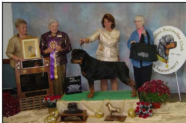
Best in Speciality Show - CH Cammcastles Friar Tuck