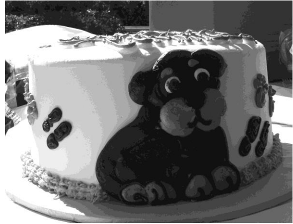
A Rottweiler Cake!