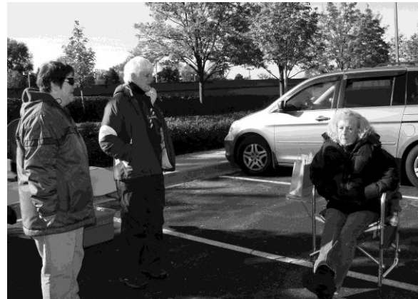
Waiting for it to warm up