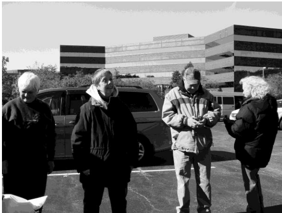
MRC Members at Tracking Site